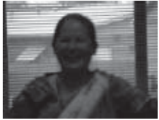
sense of humour